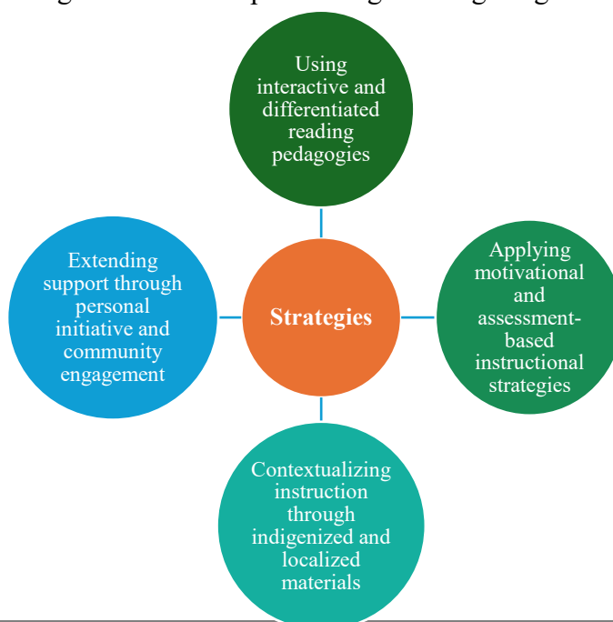
Figure 3 Strategies of Reading Teachers in Implementing Reading Programs

Reading teachers employed various strategies to effectively implement reading programs for Ata-Manobo students in response to the challenges encountered in practice. These strategies reflect their efforts to adapt instruction, address learners' diverse needs, and sustain engagement in reading activities within their specific contexts. Figure 3 presents the strategies of reading teachers in implementing reading programs for Ata-Manobo students.