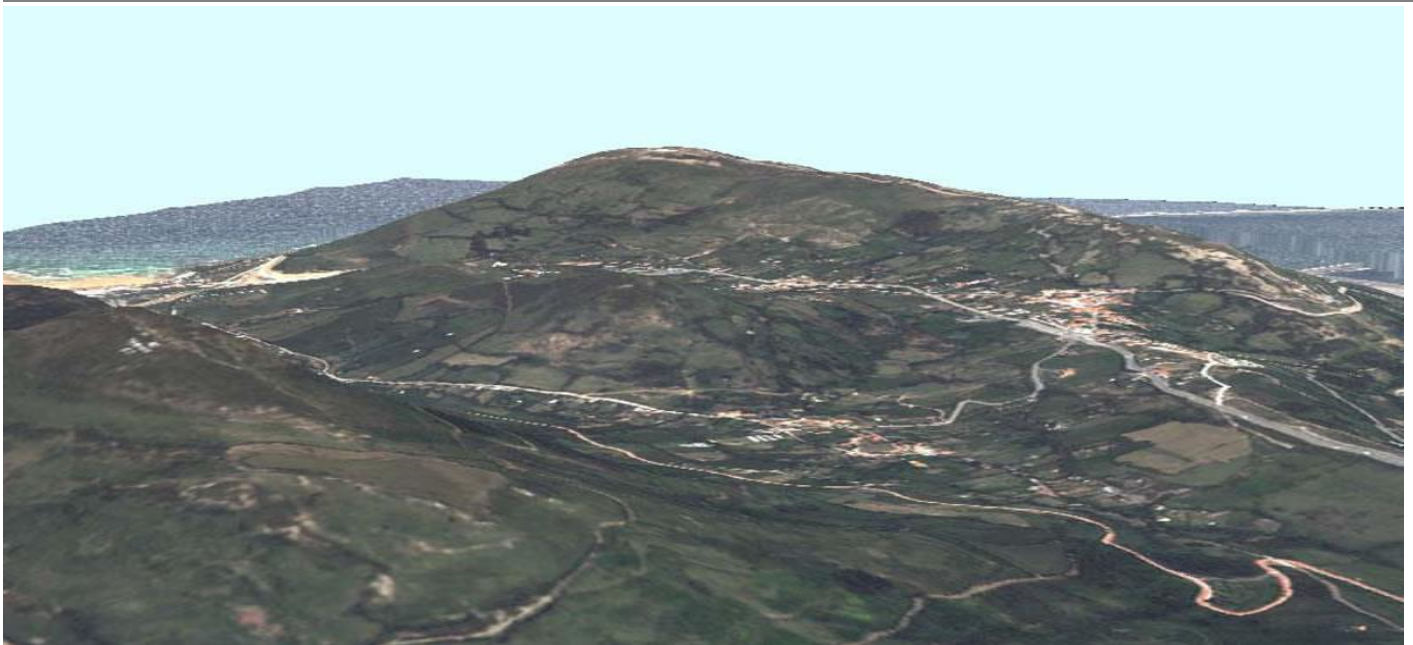
Figure.5 The information basis for 3D model design

Spatial resolution of modern ultra-high-resolution sensors allows not only to detect objects of geotechnical system, but also to assess their external condition. By analysing the information of OSA, BHRC-60 and KBP-100 sensors it is possible to detect the violation of the external coating of pipelines, change and violation of the shape or integrity of the surrounding MT walls, change of the geometry and shape of spherical and cylindrical tanks, etc. Earlier we have noted that the main purpose of the method of geotechnical diagnostics of ML using space multispectral images of ultra-high spatial resolution is to identify potentially hazardous areas on the route of its laying. Such potentially hazardous areas may be, for example, areas of the territory subject to water accumulation. In such areas high corrosive activity of soils is possible, which may lead to further development of MT defects. Besides, systematisation and integration of all data obtained during interpretation and analytical processing of space images allows to identify areas of origin of the ML route under roads, under railway tracks, areas of pipeline bends caused by geodynamic processes, etc. Relief analyses are also a source of information on hazardous areas. Figures 6 and 7 show examples of diagnosing potentially hazardous areas requiring continuous aerospace monitoring.