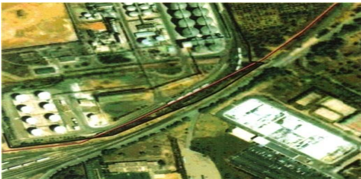
Figure.6 Examples of diagnosing potentially hazardous areas

Spatial resolution of modern ultra-high-resolution sensors allows not only to detect objects of geotechnical system, but also to assess their external condition. By analysing the information of OSA, BHRC-60 and KBP-100 sensors it is possible to detect the violation of the external coating of pipelines, change and violation of the shape or integrity of the surrounding MT walls, change of the geometry and shape of spherical and cylindrical tanks, etc. Earlier we have noted that the main purpose of the method of geotechnical diagnostics of ML using space multispectral images of ultra-high spatial resolution is to identify potentially hazardous areas on the route of its laying. Such potentially hazardous areas may be, for example, areas of the territory subject to water accumulation. In such areas high corrosive activity of soils is possible, which may lead to further development of MT defects. Besides, systematisation and integration of all data obtained during interpretation and analytical processing of space images allows to identify areas of origin of the ML route under roads, under railway tracks, areas of pipeline bends caused by geodynamic processes, etc. Relief analyses are also a source of information on hazardous areas. Figures 6 and 7 show examples of diagnosing potentially hazardous areas requiring continuous aerospace monitoring.