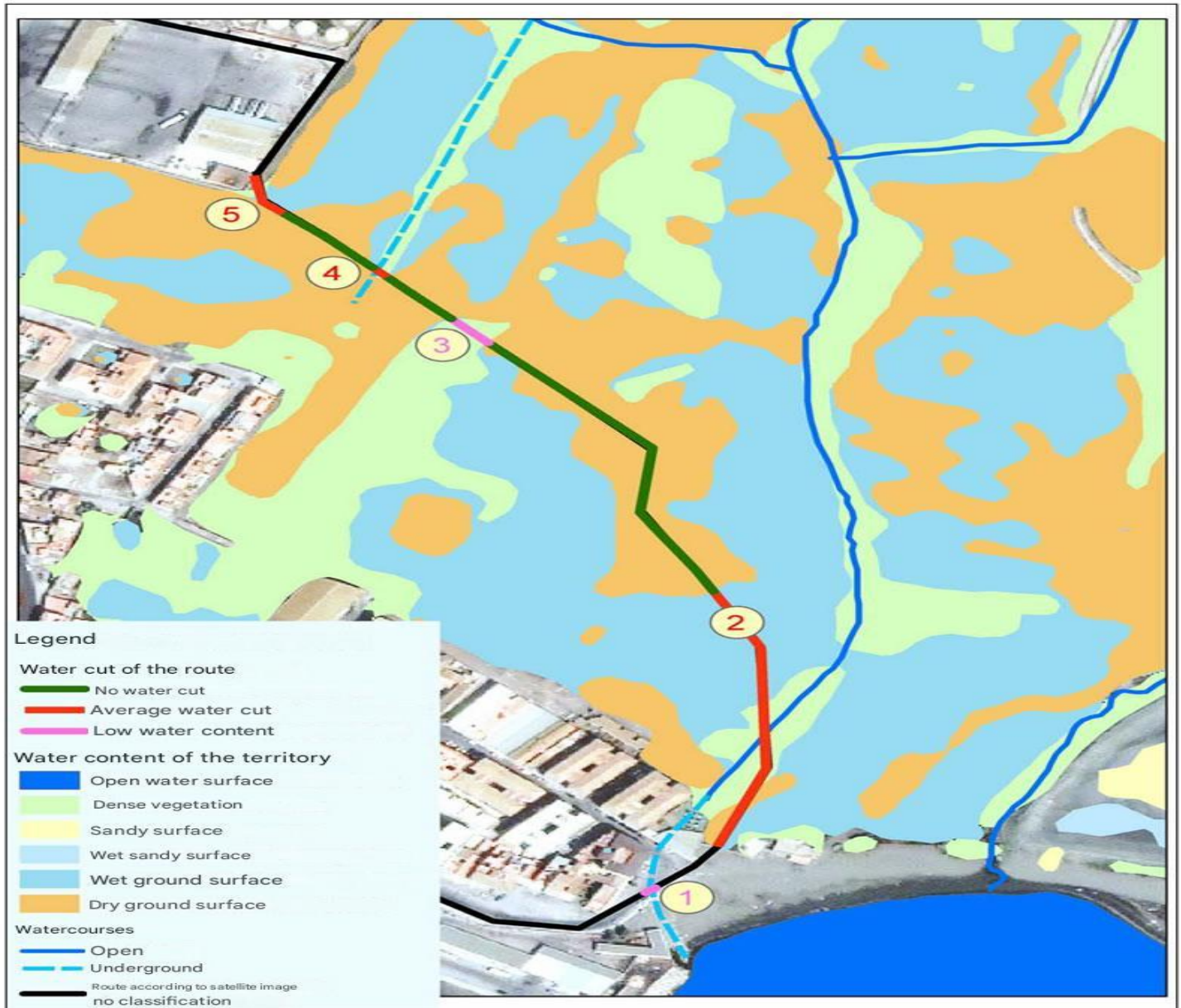
Figure 4. Thematic map of soil moisture assessment around the gas pipeline installation.

As a result, areas of high moisture hazard and areas covered with dense vegetation were identified, which may serve as an indicator of the presence of water. Based on the results of soil moisture assessment in the MT laying corridor, the places where the gas pipeline crosses the areas of high humidity were identified [7]