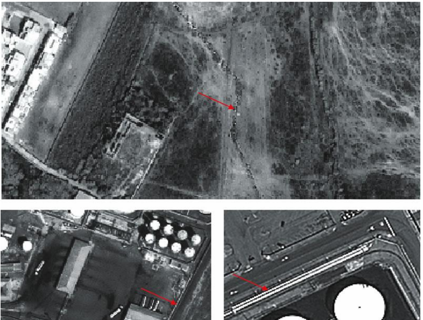
Figure.1 Determination of the trunk pipeline laying route based on sensor data from Ikonos-2 and Quick Bird-2 space systems.

When solving this problem on the basis of space images received from Ikonos-2 and Quick Bird-2 systems it turned out that the most informative are red channel No.3 and near infrared channel No.4. The use of these spectral channels makes it possible to identify open areas of the MT and clearly detect the route of underground pipelines (Figure.1).