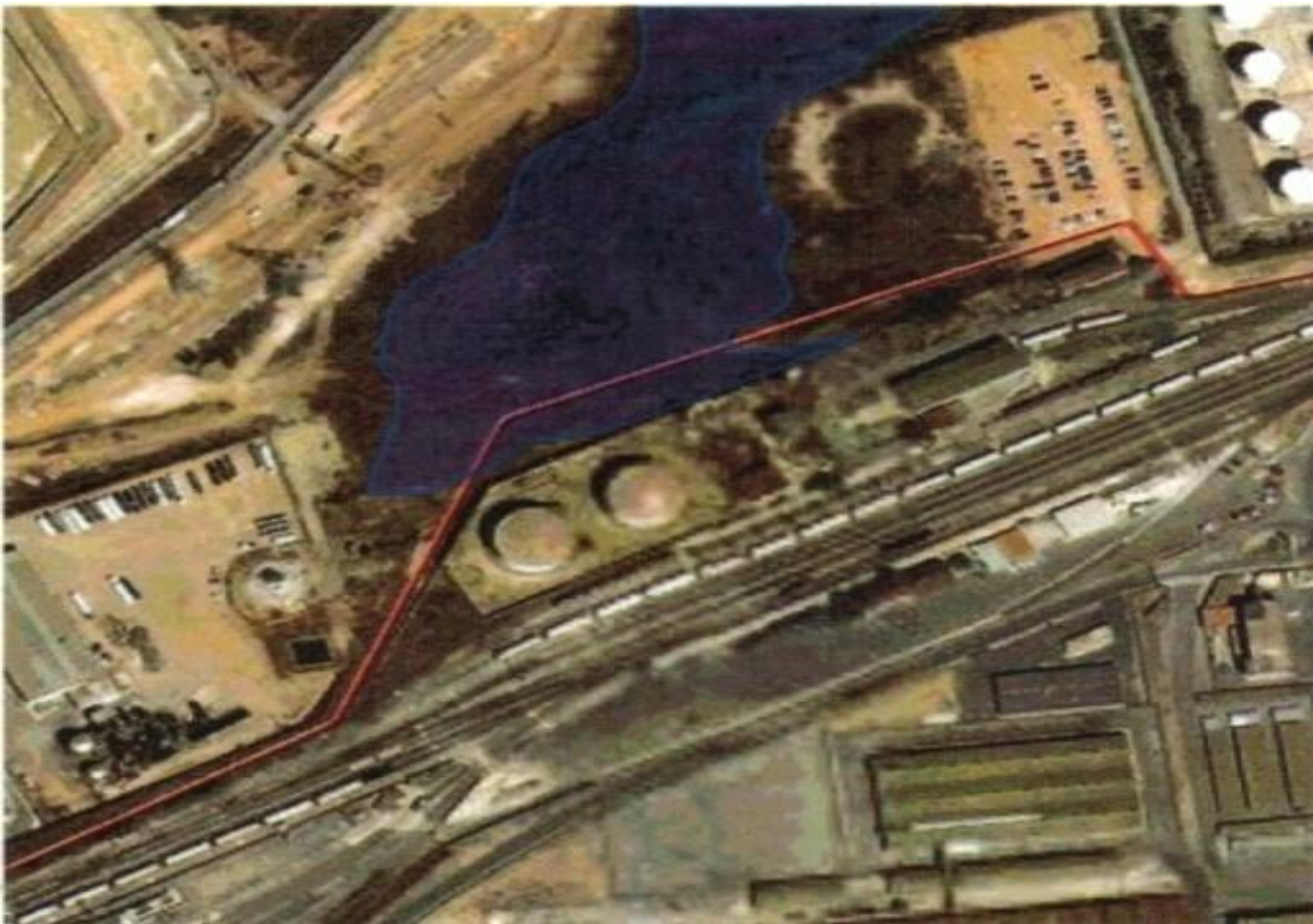
Figure.7 Examples of diagnosing potentially hazardous areas

Reliability of the results of geotechnical diagnostics of potentially hazardous areas of the technical corridor of the MT installation based on space images of high spatial resolution was checked by comparison with the ground diagnostics data. [9-10] In the selected MT laying area defects were detected in 4 out of 5 sections identified by space diagnostics.