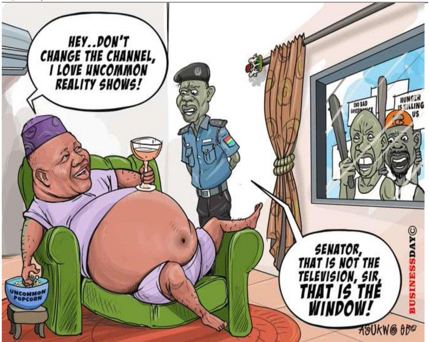
Figure 2: The Reality is Closer Than You Think.